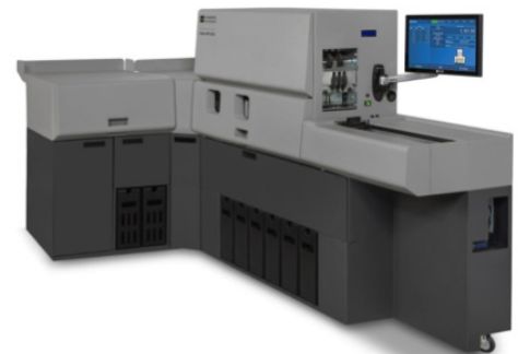
Cummins JetScan MPX 8215 shown with two strappers.